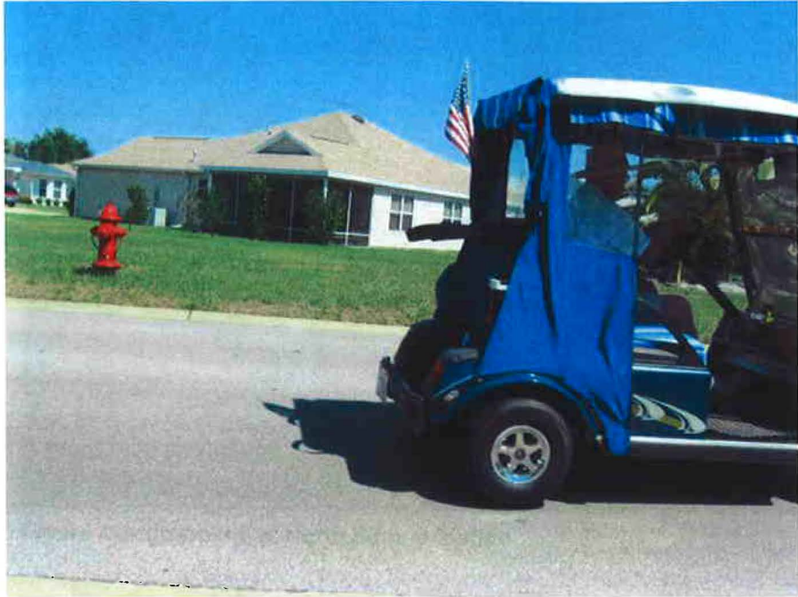
Figure 2 Northbound at South Survey Station

The results of the photo comparison indicated that 114 vehicles northbound and 114 vehicles southbound during the study period were utilizing Oak Forest Boulevard as a cut-through route which equates to approximately 60% of the traffic on Oak Forest Boulevard is cut-through traffic.