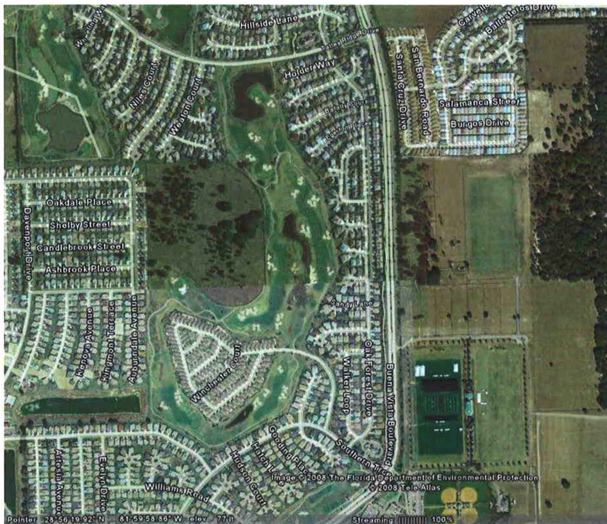
Figure 1 Vicinity Map

Sumter County has been working with The Villages to address the concerns of the residents. During several meetings, several potential solutions have been developed and the pro and cons of each have been identified. In order to determine the best solution, Sumter County officials decided that an engineering study needed to be completed to identify the specific issues so that a solution that best addresses the issues could be developed and implemented. A vicinity map of the area under study is shown in Figure 1.