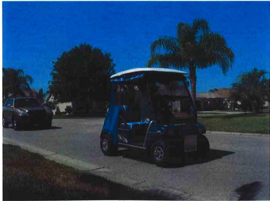
Figure 3 Northbound at North Survey Station