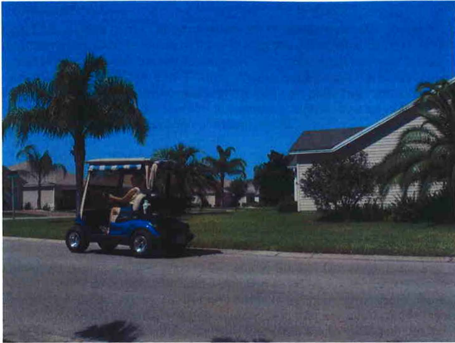
Figure 4 Southbound at North Survey Station