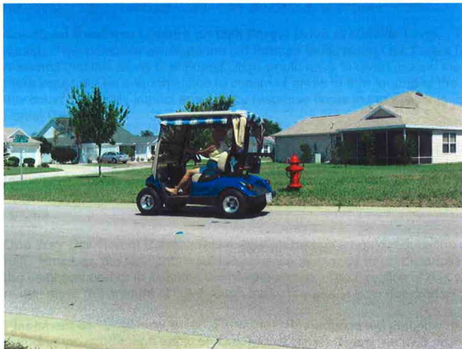
Figure 5 Southbound at South Survey Station