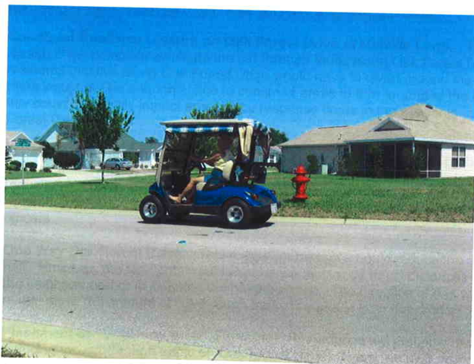
Figure 5 Southbound at South Survey Station