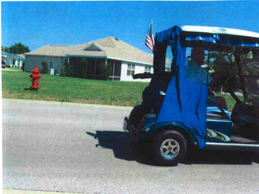
Figure 2 Northbound at South Survey Station

The results of the photo comparison indicated that 114 vehicles northbound and 114 vehicles southbound during the study period were utilizing Oak Forest Boulevard as a cut-through route which equates to approximately 60% of the traffic on Oak Forest Boulevard is cut-through traffic.