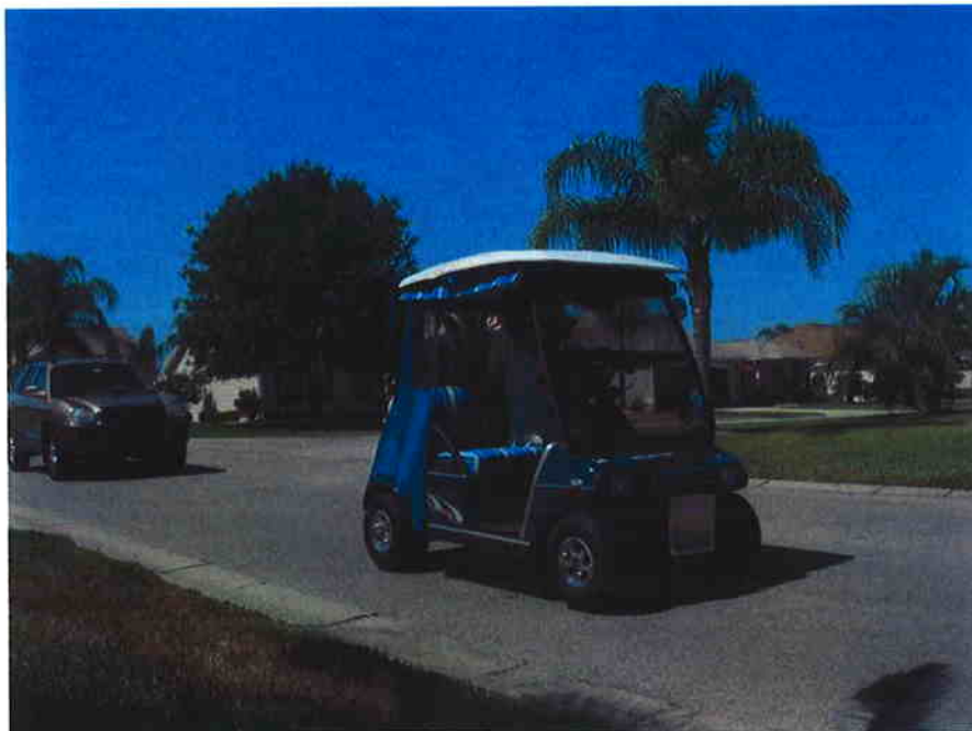
Figure 3 Northbound at North Survey Station