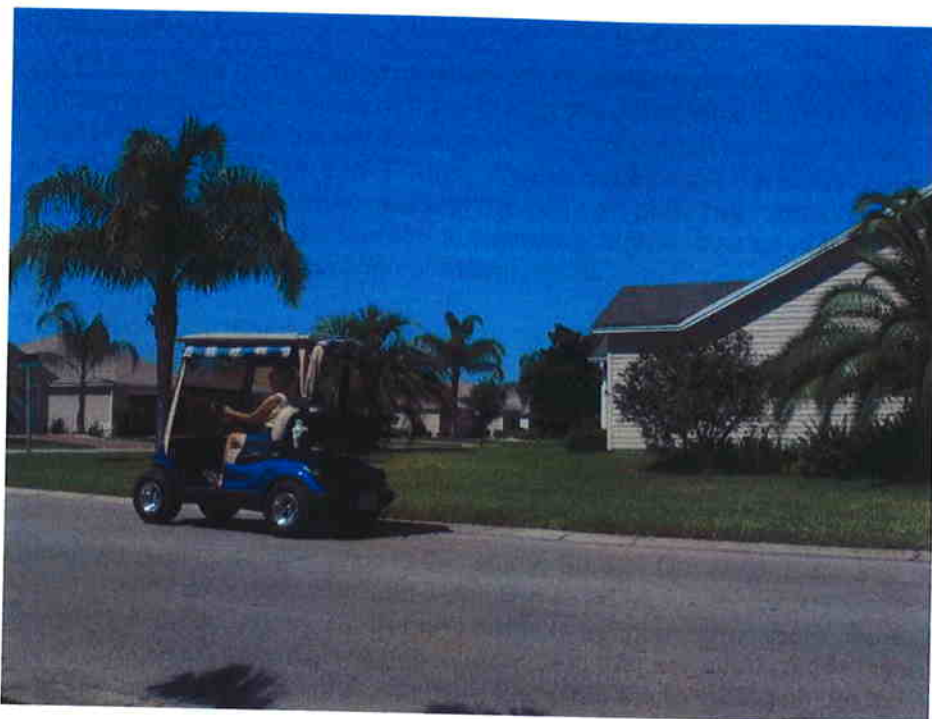
Figure 4 Southbound at North Survey Station